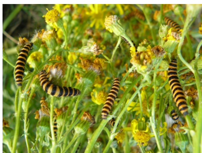
Summer 2013